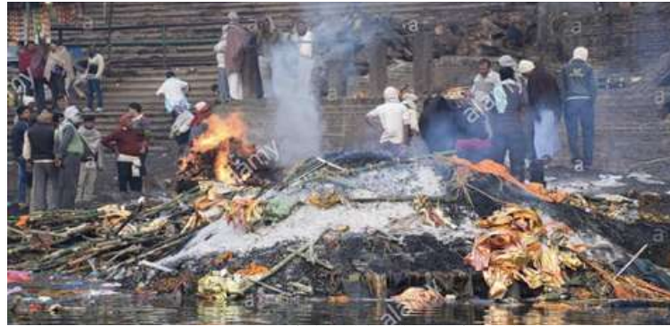
Cremation of dead bodies after the ritual activities.

and thinking rather than an organized religion. The Hindu religion shows a remarkable syncretism conciliating a great number of beliefs and practices. It involves all the aspects of the human life and is not reduced to a simple ideology. The daily actions are more constant and determined than beliefs. For the millions of people who practice this religion, it is a way of life that encompasses all aspects of